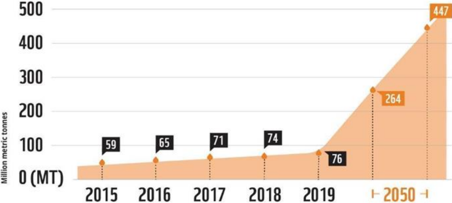
Figure 1: Overview of historic and estimated future demand for palm oil